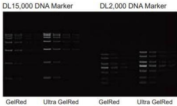
Fig 1. The results of Ultra GelRed and standard GelRed nucleic acid gel staining

Fig 1. and Fig 2. are NeoDye DNA Reddy nucleic acid electrophoresis and cell membrane permeability assay (cytotoxicity assay), respectively