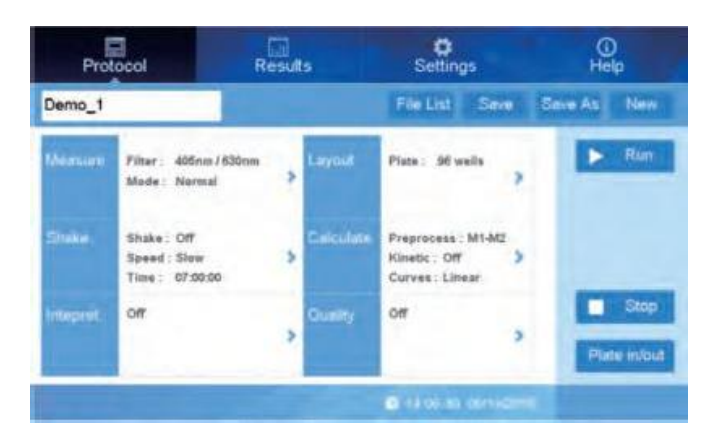
AMR-100 Operaton Interface